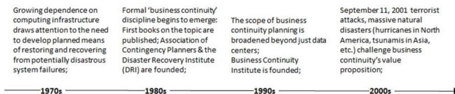
Figure 3b: Organizational Resilience Timeline: BCM Dimension

While disaster risk reduction, as a somewhat organized endeavour, emerged a few years prior to business continuity management, both DRR and BCM essentially came of age in the course of the past four decades. As suggested by figures 3a and 3b, the impetus for disaster risk reduction came out of the rise of global efforts to mitigate the impact of disasters and catastrophes (Carrel, 2010; Moran, 2014), while the growing dependence of businesses and governments on electronic communication and data infrastructure provided the motivation for business continuity management (Doefel, Chewning & Lai, 2013; Fleming, 2012; Kantur & Arzu, 2012).