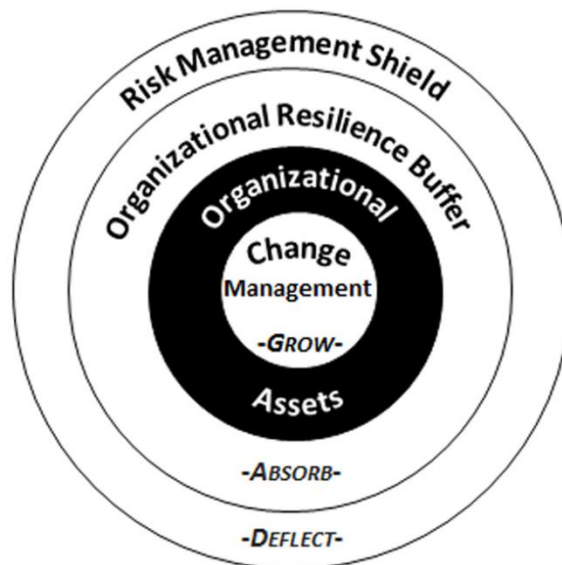
Figure 4: Total Exposure Management: Roles and Responsibilities of Component Disciplines

of cutting edge practices and technologies.