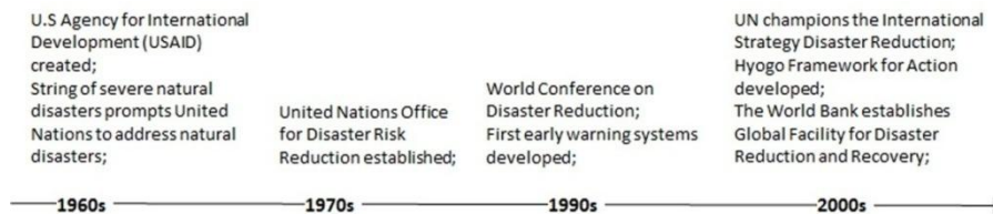
Figure 3a Organizational Resilience Timeline: DRR Dimension

Torabi & Mansouri, 2015; Shaffi, 2005). Consider figures 3a and 3b, which show a high development timeline of DRR and BCM, respectively.