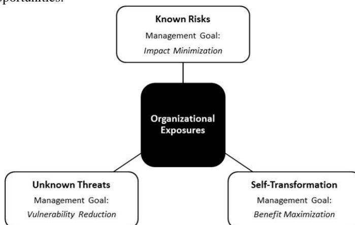
Figure 1: Distinct Disciplines Focused on Organizational Exposure Management

management efforts (Bromiley et al., 2014; COSO, 2004; ISO 31000, 2009), while others are treated as stand-alone activities. In the course of the last couple of decades three distinct, threat abatement focused disciplines emerged: 1. risk management, focused on minimizing the impact of known risks; 2. organizational resilience, focused on reducing vulnerability to unknown (i.e., not estimable) threats; and 3. Change management, concerned primarily with maximizing the benefit of emerging opportunities.